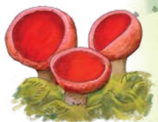
Elf cap fungus