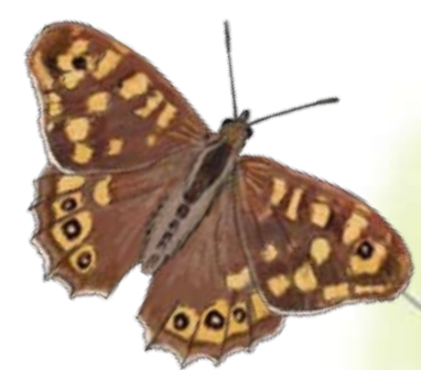
Speckled wood butterfly