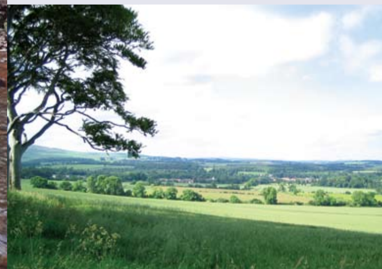
View from Winding Law

Head out of the village on the Haddington Road and take the first track on the right. At the top of the track head around two sides of a field until you see a "Public Path" sign. Continue along a field margin and turn left onto a track heading up to Winding Law. There are great views across to the Firth of Forth to the north and the Lammermuir Hills to the south. 1.6 kilometres either way.