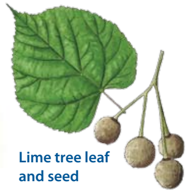
Lime tree leaf and seed